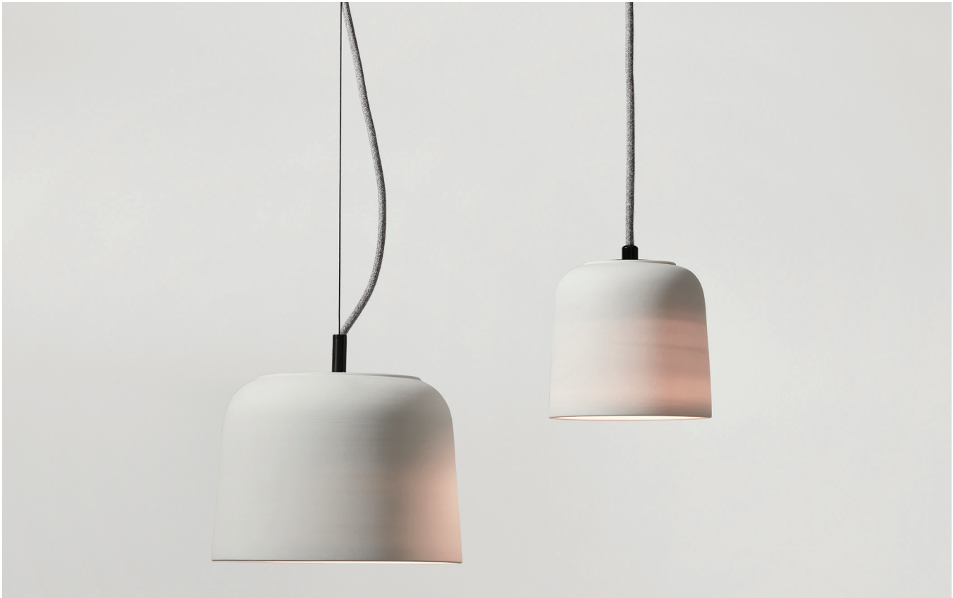
Potter Halo, medium and small