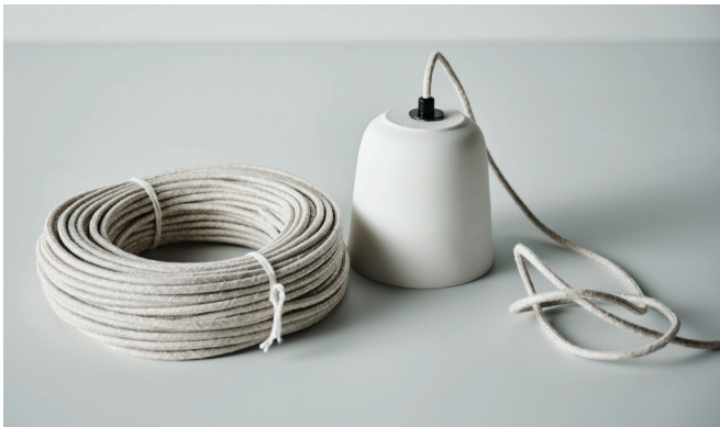
Flex option – Natural grey linen