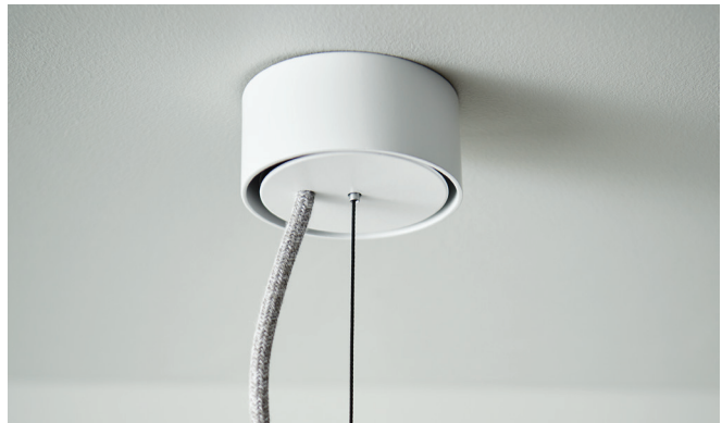
White ceiling canopy, flex option – Mid grey linen

Handmade to the same size and shape specifications as the other fittings in the Potter Light family, the Potter Halo is thrown on a potter's wheel using a specially formulated, high-grade porcelain. Sourced from a producer in Australia, the porcelain used to make the Potter Halo is internationally regarded as one of the finest in the world. Its highly refined nature produces a semi-translucent surface that glows softly when illuminated from within.