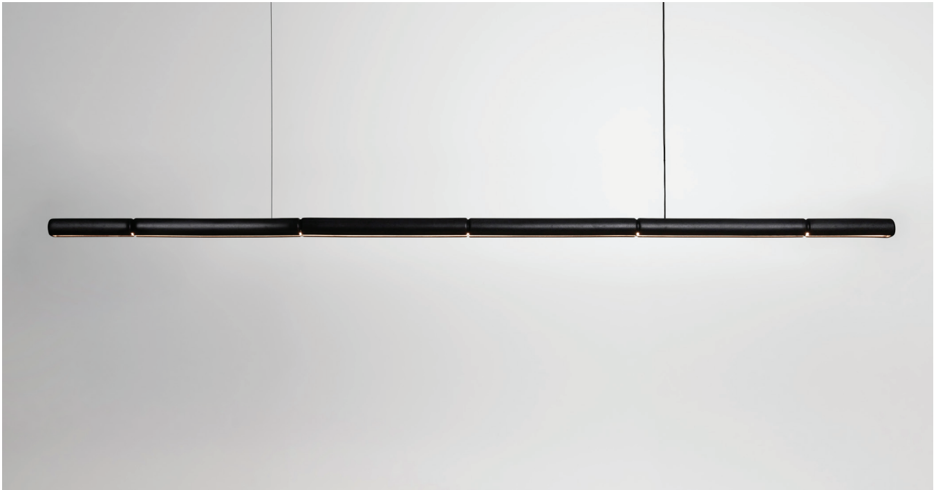
Potter DS, pendant, 2250 – DS Charcoal