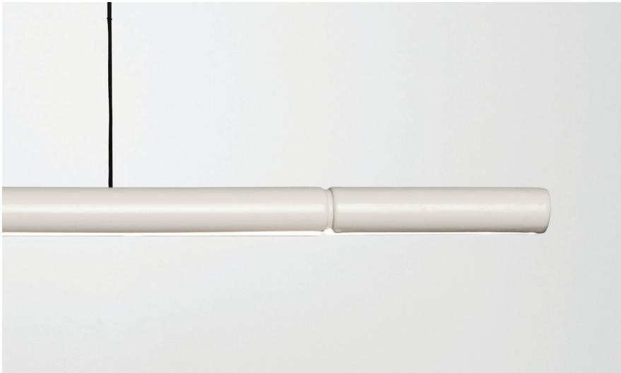
Potter DS, pendant, 1800 – DS White