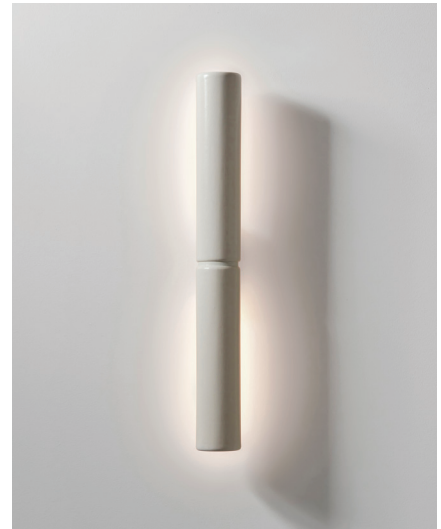
Potter DS, wall mount – DS White

Designed by Bruce Rowe for Anchor, the ceramic Potter DS wall and pendant lights are the outcome of a creative and technical collaboration with our long-term lighting partner, Rakumba Lighting and master potter, Michael Skewes. Designed and made using a hybrid process of traditional ceramic techniques and contemporary digital tools, the DS is simple and refined, focusing on the essential beauty of the ceramic form to direct and reflect light. The external simplicity of the handmade ceramic form houses integrated aluminium and acrylic extrusions and a resolved LED lighting solution.